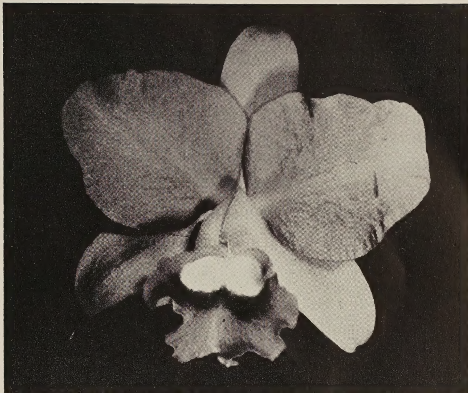
C. PORCIA, CANNIZARO VAR., A.M., R.H.S. (C. Armstrongiae x C. Bowringiana)

One of the finest of the cluster type cattleyas. It bears around 12 flowers to a spray. We offer seedlings with Porcia as a parent.